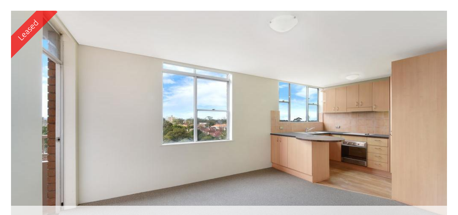
32/3-7 Bariston Avenue, Cremorne